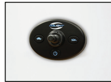
Hardwired Joystick Dash Remote 3020-D