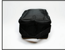
Nylon Carrying Case 18000