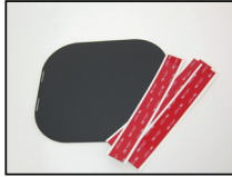
Mag Base Adapter Kit 16308