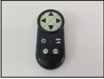
Wireless Handheld Remote 30300