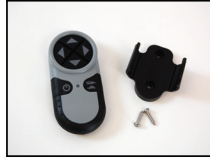
Remote Holster 30111 Remote Not Included