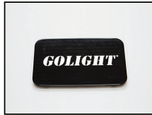
Halogen Rockguard Cover 15305 - White 15306 - Black