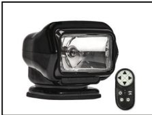
STRYKER ST HALOGEN 30002ST (White) 30512ST (Black) 30062ST (Chrome)

Package Includes: Wireless Handheld Remote 15' Power Cord with Cigarette Plug Attached Magnetic Base Rockguard