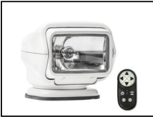
STRYKER ST HALOGEN 3000ST (White) 3051ST (Black) 3006ST (Chrome)

Package Includes: Wireless Handheld Remote Stainless Steel Mounting Bracket Rockguard