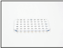
Snap On LED Flood Lens 15420