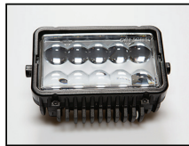
Stryker LED Insert 15433