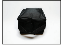
Nylon Carrying Case 18000