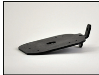
Jeep Mounting Bracket 16311 - Drivers Side 16312 - Passenger Side